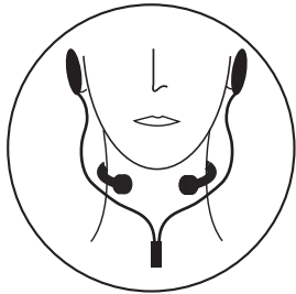
Diagram of throat mic on neck.

For users with larger neck sizes, the GP's neckband is adjustable. To increase the diameter of the neckband, simply hold the area where the neckband meets the transponder and pull gently to slide the extendable neckband down. Reverse this procedure to decrease the diameter.